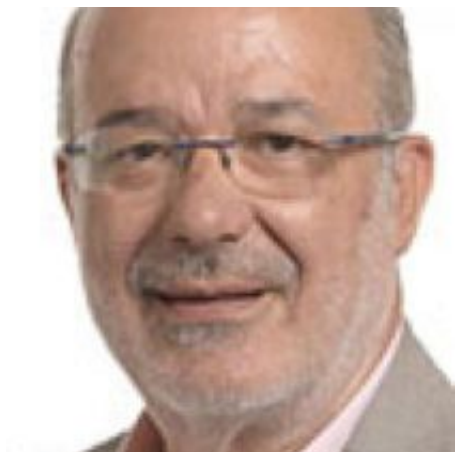
Josep Maria Terricabras

EFA President and first Vice President of the Greens/EFA Group