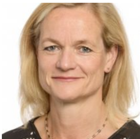
Viola Von Cramon-Taubadel