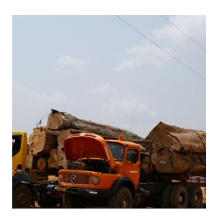
EPP must stop fanning the flames of climate catastroph...