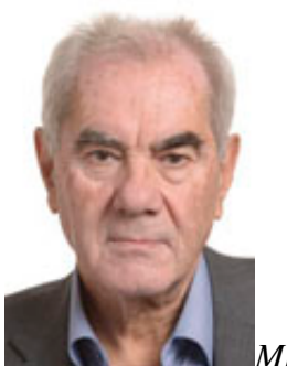
MEP Ernest Maragall

But MEPs rejected an amendment calling for the documentation about the programme to be made available in the languages of the school systems in the countries in which Erasmus+ operates. It was hoped that making documents available in languages of education such as Catalan, Basque and others would help improve access to the scheme.