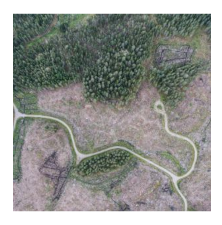
EPP attack on Deforestation Regulation thwarted