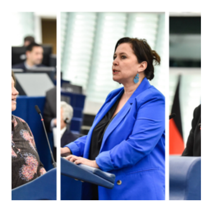
The EU-Chile Trade Agreement: A challenge to European ...