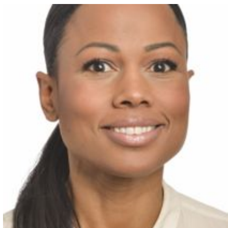
Alice Bah Kuhnke