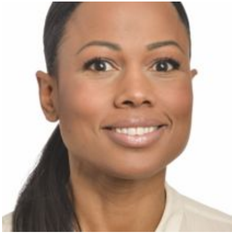
Alice Bah Kuhnke