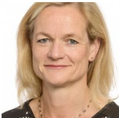
Viola Von Cramon-Taubadel