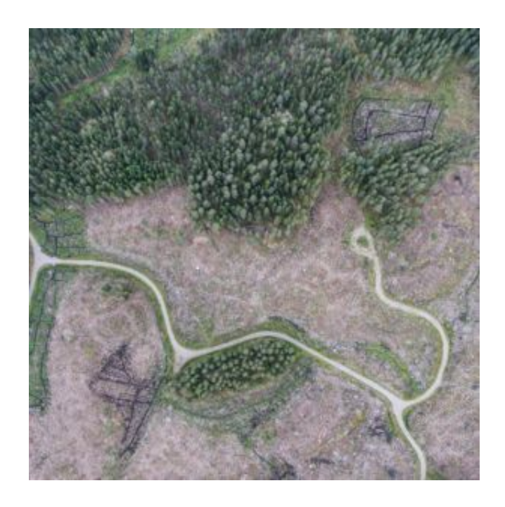
EPP attack on Deforestation Regulation thwarted