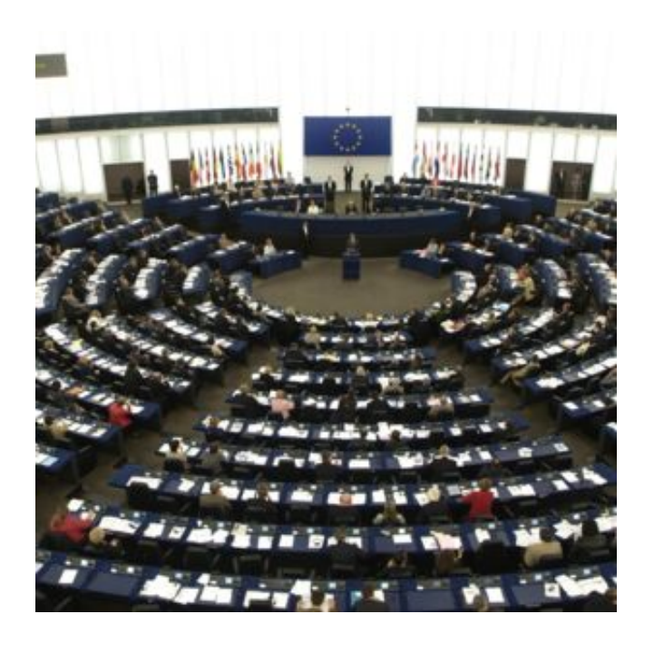
Plenary Flash 21 - 24 October 2024