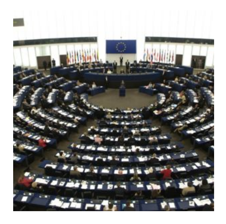
Plenary Flash 25 - 28 November 2024