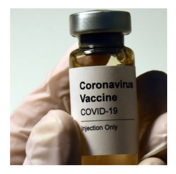
Covid-19 vaccine