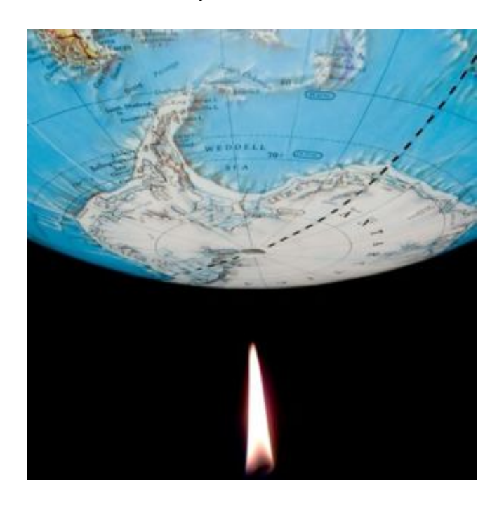
COP29: $300bn climate finance deal clinched in last di...