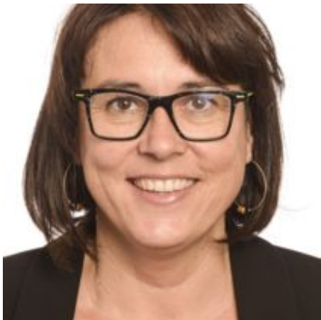
Diana Riba i Giner

EFA President and first Vice President of the Greens/EFA Group