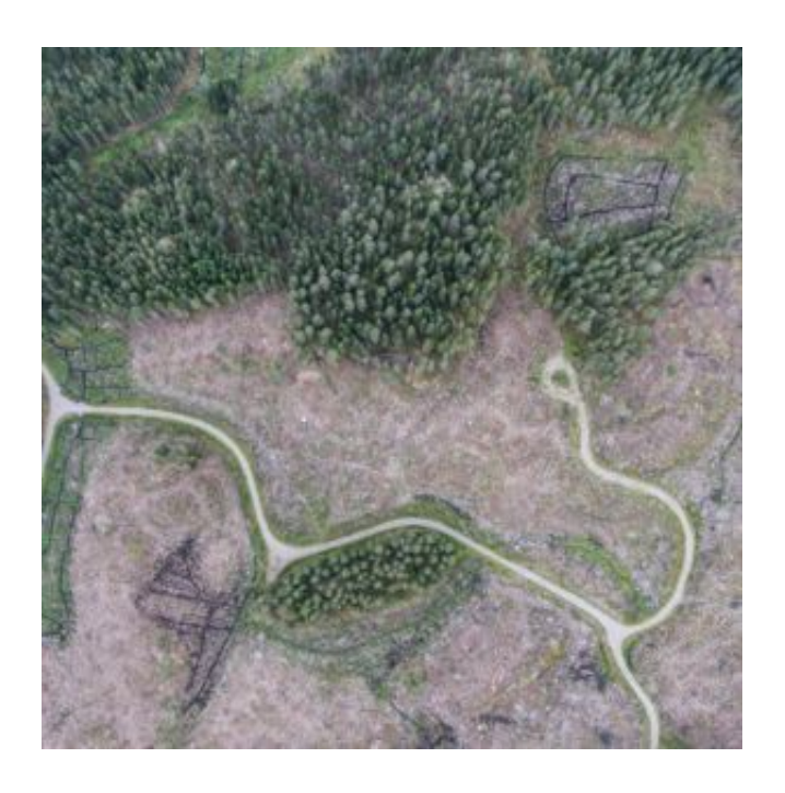
EPP attack on Deforestation Regulation thwarted