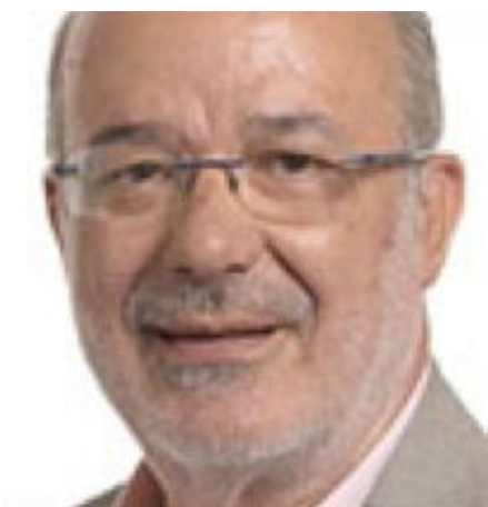
Josep Maria Terricabras

EFA President and first Vice President of the Greens/EFA Group