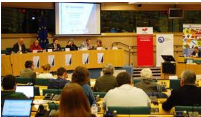
Basque Friendship Group in the European Parliament

MEPs have called for the Spanish government to enter into dialogue in the search for a lasting peace, with EU support if necessary.