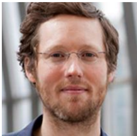
Jan Philipp Albrecht