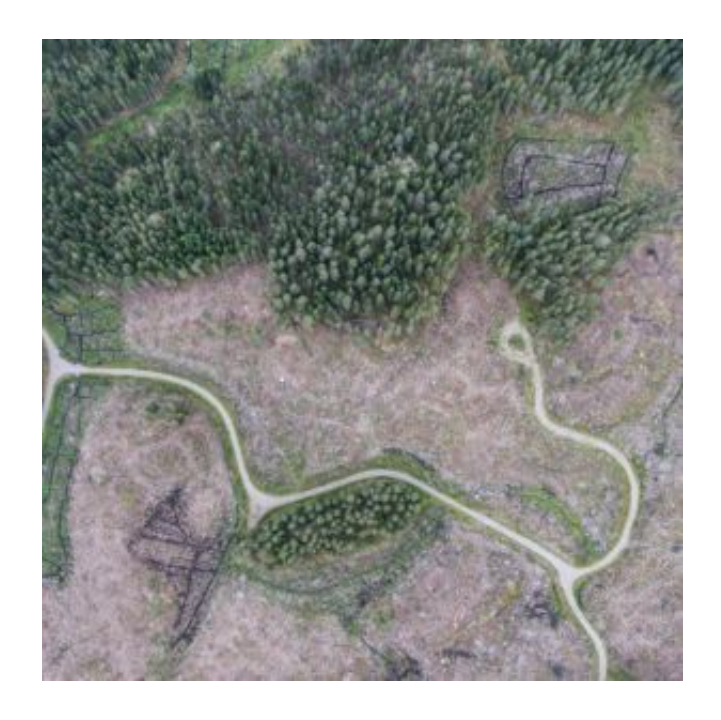
EPP attack on Deforestation Regulation thwarted