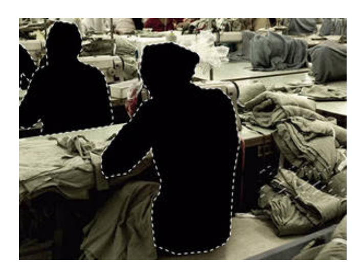
A blog by MEP Davor Skrlec

The clothing industry is arguably second only to oil as the world's most polluting industry[1]. From the many dyes and chemicals used which pollute the soil and water, to the pesticides used in cotton fields (without even mentioning the chemicals used in synthetic fabrics), the industry has proven to be deeply damaging to the environment.