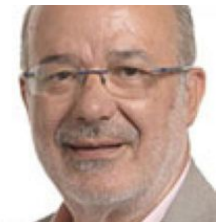
Josep Maria Terricabras

EFA President and first Vice President of the Greens/EFA Group