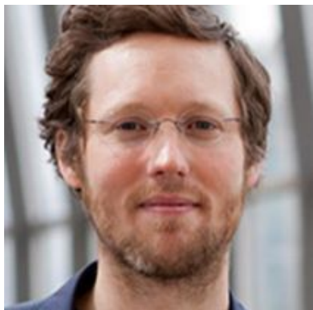
Jan Philipp Albrecht