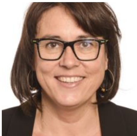
Diana Riba i Giner

EFA President and first Vice President of the Greens/EFA Group