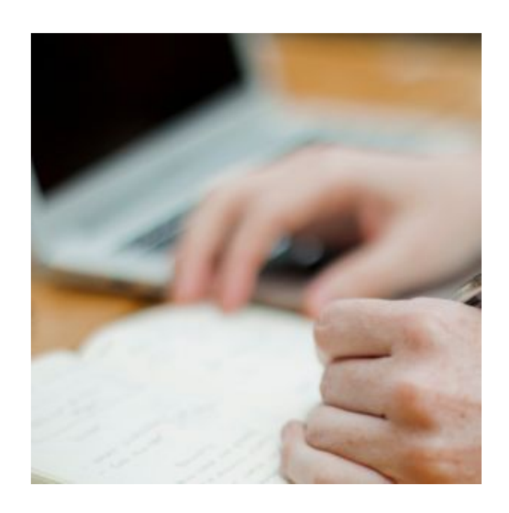
Policy Adviser for the SEDE Committee