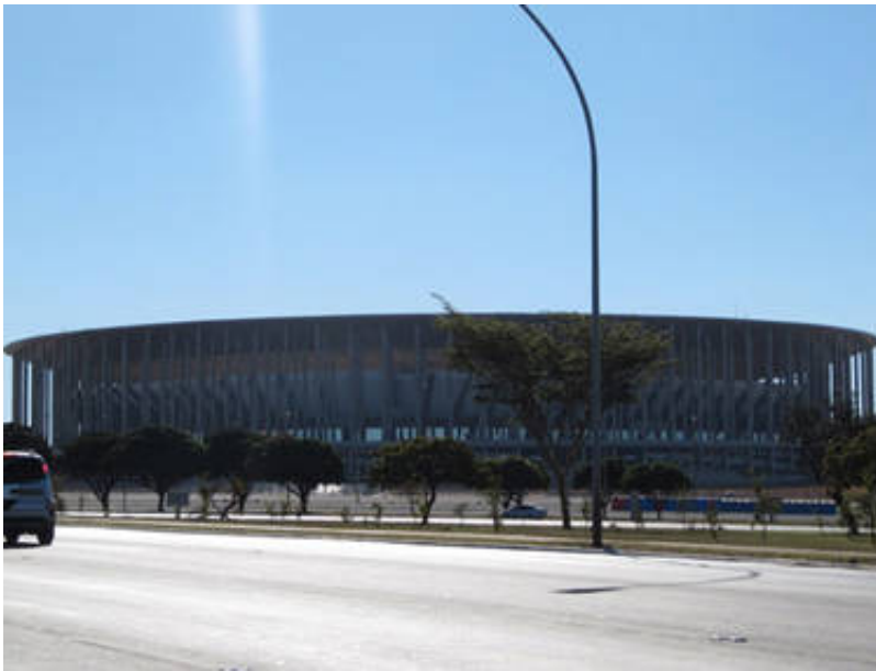
Controversial newly constructed stadium