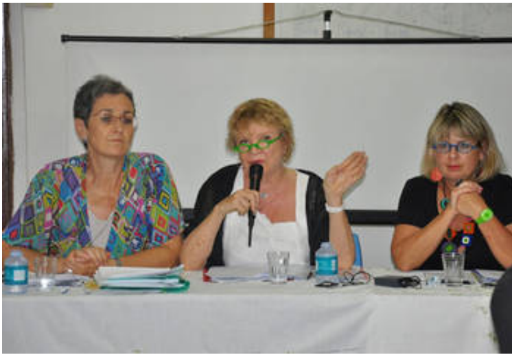
Press Conference by Green MEPs (Left to Right) Ulrike Lunacek (Austria) Eva Joly (France) and Catherine Greze (France) in Belem, Brazil