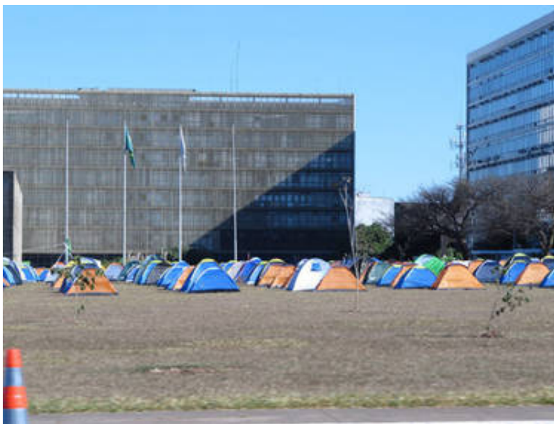
Tents of demonstrators next to the Brazilian Congress

Brasilia, Sunday 7th July 2013 - Arriving at a sensitive time Brazil is currently going through a very sensitive period. There is even talk on the streets of an "Amazonian Spring". All of a sudden thousands, and then hundreds of thousands of people, mostly under the age of 25, have come out onto the streets of Brazilian cities. From Sao Paulo to Amazonia, several huge "development" projects have come under scrutiny from citizens, putting the Brazilian government in an uncomfortable position.