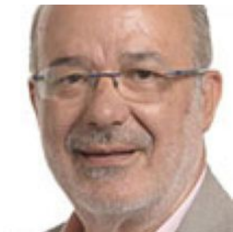
Josep Maria Terricabras

EFA President and first Vice President of the Greens/EFA Group