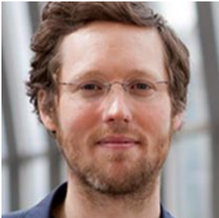
Jan Philipp Albrecht