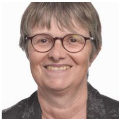
Molly Scott Cato