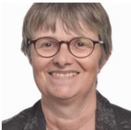
Molly Scott Cato