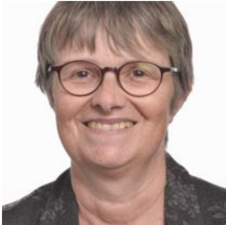
Molly Scott Cato