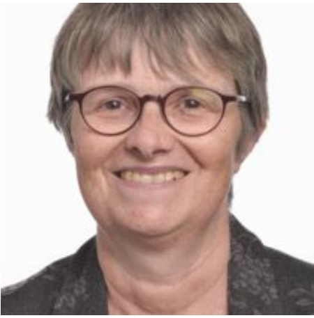
Molly Scott Cato